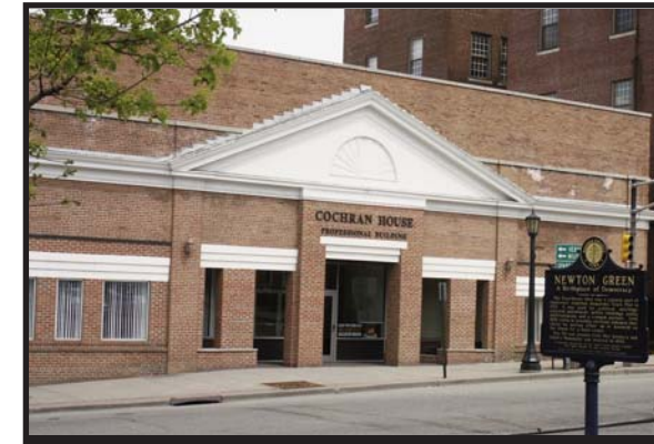
Sussex County Clerk's Office Hall of Records

Once the applicant receives the notice of commission from the State, he/she should come into the Clerk's Office to be sworn in (this must be done within three months of issuance, or the commission expires). There is a $15 filing fee due to the Clerk upon taking of the oath.